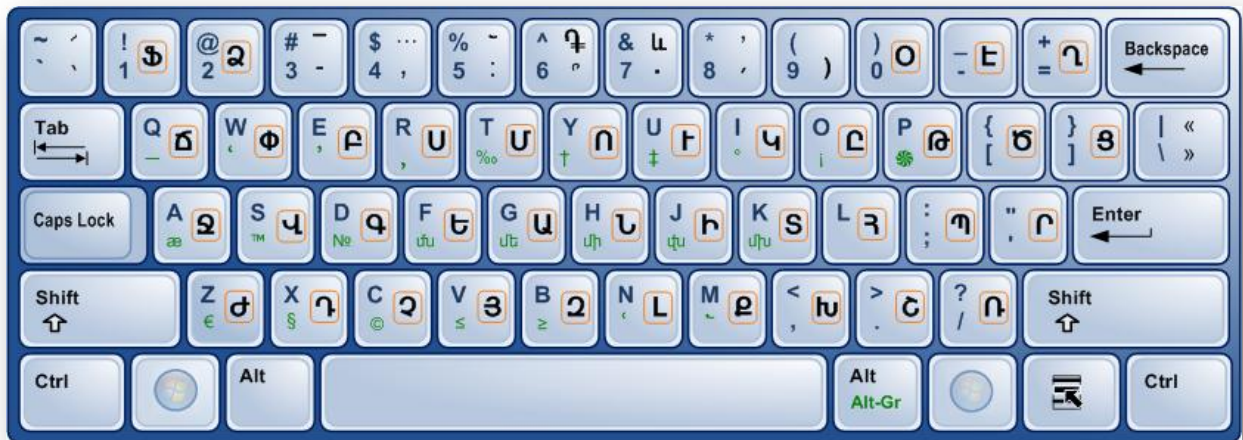
Figure 4 Armenian Typewriter keyboard layout

The Armenian Typewriter keyboard layout is statistically designed to have the best ergonomics when typing Armenian text. The layout of the keyboard is shown in Figure 4 below: