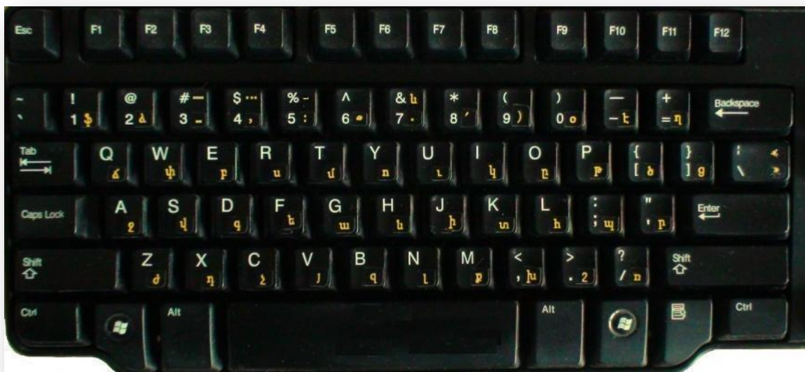
Figure 5 Standard US Dell keyboard with Armenian labels (the yellow characters)

If you are new to Armenian typing, it is highly recommended that you learn typing using the Armenian Typewriter keyboard layout, instead of the ergonomically inefficient Windows Vista Armenian keyboards. For beginner typists, the keyboard layout image in Figure 4 may be all that is needed in order to learn Armenian typing. There is also a high-resolution of this image in the keyboard installer package. Print this image and place it in front of you when typing until you are confident enough to type without looking at the layout. There are also commercially available keyboard labels that you can purchase and place them on your keyboard, but be aware that cluttering your keyboard with labels will work against you in the future. As a precaution, only place small labels that have different color than the color of the keys on your existing keyboard. Figure 5 shows an ideal labeling for the Armenian Typewriter layout on a standard US Dell keyboard.