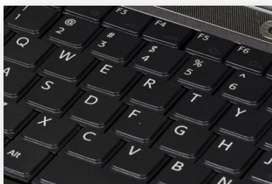
Figure 1 QWERTY keyboard

concluding that, indeed QWERTY will be more efficient in the case of Armenian compared to the English language. This is quite absurd, are we after the ergonomic efficiency or inefficiency when designing a keyboard?