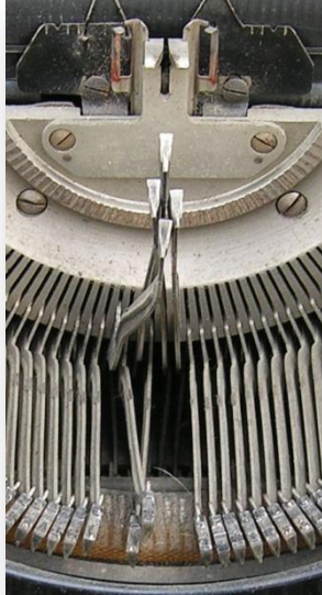
Figure 2 Type-bar jam

of the instrument, in the computer interface design, especially at its early stages of development, lagged considerably towards ergonomic efficiency of the main input device, namely, the keyboard. The reason for this is indeed a historic paradox, and goes back to the days of the invention of the first mechanical typewriter. The “legend” has it that, in 1860’s when mechanical typewriters were being developed and used, a problem soon became eminent. The problem occurred when typists typed text very fast, in which case the neighboring metal arms (or type-bars) of the machine jammed into each other (see Figure 2). In 1870, Christopher Sholes, a newspaper editor and printer in Milwaukee, devised a new keyboard arrangement based on the studies of the educator Amos Densmore on the letter-pair frequency of the English language. The Sholes keyboard solved the type-bar jam problem, and later became a great success in the chronicles of the typewriter world. Alas, the evolution spread over all manufactured typewriters, and the world of typists became so chonical to the