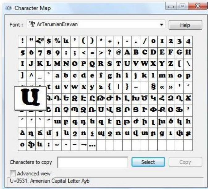
Figure 6 Character Map application

In contrast the alphabet “U” in the ARMSCII-8 encoded font would have code U+00B2.